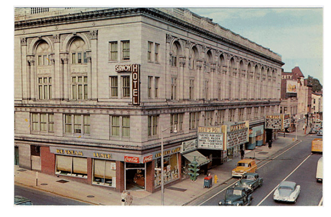
Palace and Majestic Theaters, Main Street ca. 1940

Books on Local History Genealogy sources City Directories Sources both on & off line Local newspapers and Newspaper clippings Connecticut and New England history Materials on P.T. Barnum And the Circus Photographs and Postcards Maps Special Collections